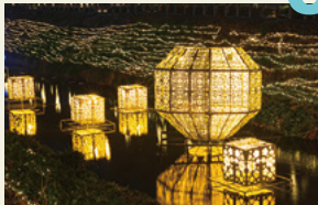
Pingtung City 08 Pingtung Festival of Lights