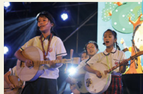
Hengchun, Checheng Townships 14 Hengchun Peninsula Song Festival