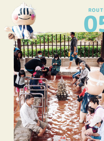
Checheng and Mudan Townships 16 Sichongxi Hot Spring Festival