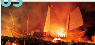
Donggang Township 12 Fiery Ying Wang Festival