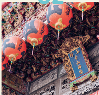
Pingtung City and Jiadong, Linluo, and Wanluan Townships 10 Lively Lantern Festival